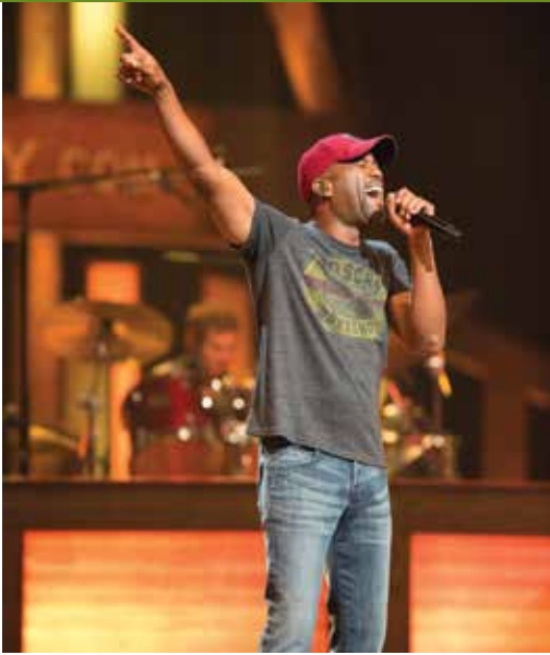
Darius Rucker in Concert.

updated on the Steadman Philippon Research Institute's website, www.sprivail.org , or you can follow them on Facebook at www.facebook.com/steadmanphilippon .