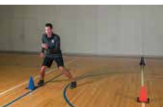
The agility T-Test assesses the patient's ability to change direction rapidly by timing navigation of a T-shaped course.