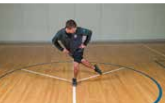
Balance and proprioception may be evaluated with the Star Excursion Balance Test, where the patient balances on one leg while reaching in defined directions with the other leg.