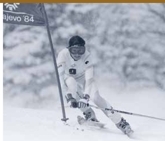
Christin Cooper, racing to a silver medal in Giant Slalom, 1984 Winter Olympics, Sarajevo.