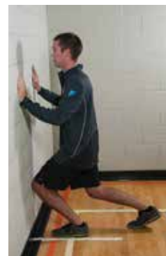
The Dorsiflexion Lunge Test, a test useful for assessing range of motion of the ankle, has the patient place his or her foot perpendicular to a wall and lunge their knee toward the wall. The foot is progressively moved further away from the wall until the maximum range of dorsiflexion is achieved.