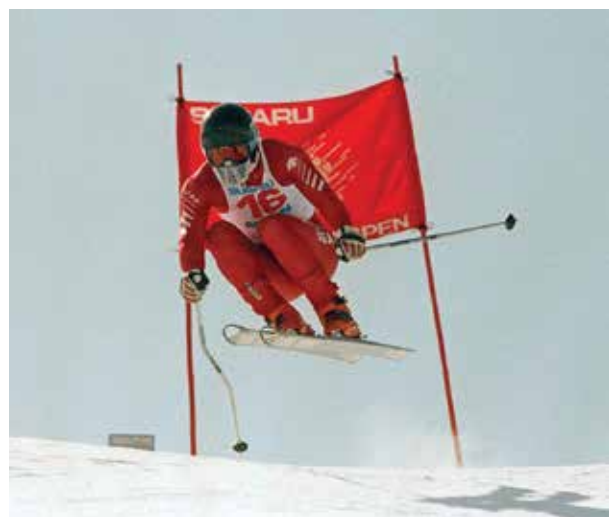
Phil Mahre becomes airborne as he skis during training run on the downhill course at Aspen, Colorado, March 2, 1984.

Phil Mahre, on his Steadman-repaired legs, became one of the most successful ski champions the United States has ever produced — 27 World Cup wins, three overall World Cup titles, two Olympic medals, one silver and one