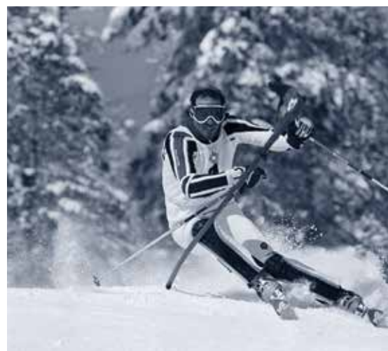
Steve Mahre races the slalom course in the first run of the men's slalom, 1984 Winter Olympics in Sarajevo, and placed second behind his twin brother, Phil Mahre to win the silver medal.