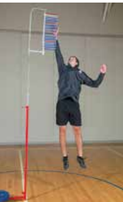
The Sargent or Vertical Jump Test measures the height the patient can jump from a squat. This mainly tests the athlete's strength (in addition to speed, energy, and dexterity).