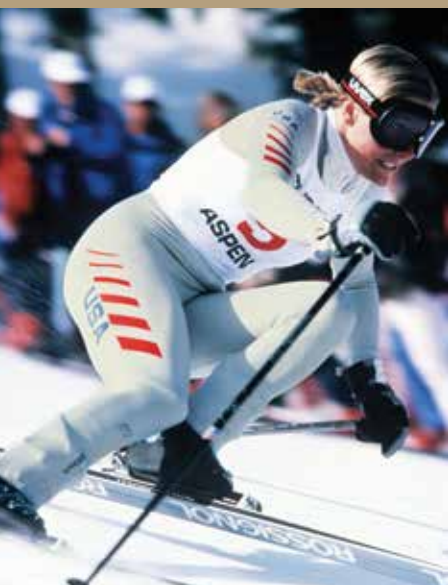
Cindy Nelson, at the Aspen Winter International, March, 1982.