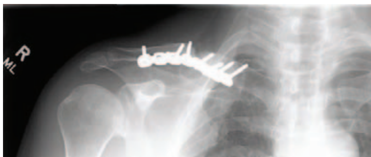
Plate and screw fixation