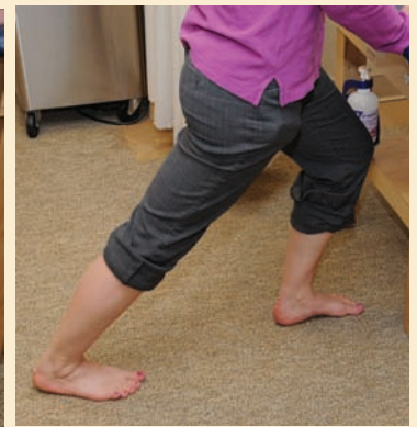
Calf Stretch, Straight Leg