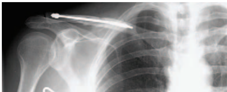
Intramedullary pin fixation